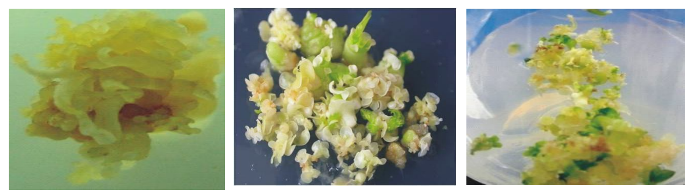
Fig. 5: Somatic embryogenesis under the influence of PEG: (a) Somatic embryo, (b) Desiccated embryo and (c) Regenerating embryo.