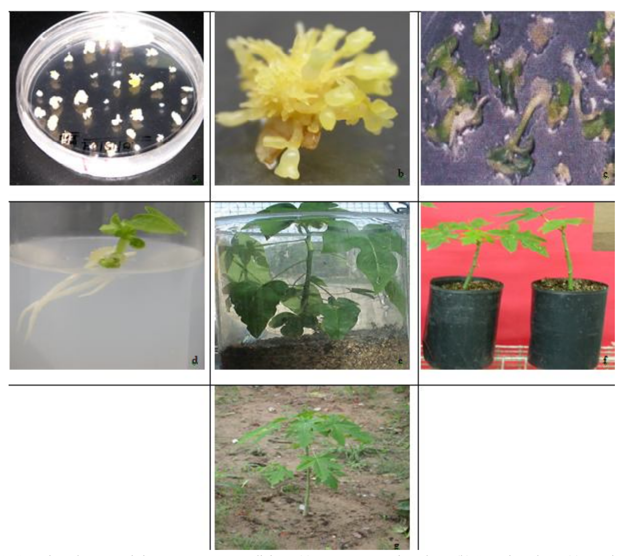
Fig. 1: Somatic embryogenesis in papaya cv. Pusa Delicious: (a) Immature zygotic embryo, (b) Somatic embryo, (c) germination of embryos, (d) Rooting of shootlet, (e) Acclimatization of plantlets, (f) Acclimatized plants in poly bags and (g) Establishment of plants in field.

of embryos and embryonic clump was also significantly higher at this concentration (table 3). The results are in accordance with Fitch (1993) and Cai et al. (1999), who also found that 2,4-D at 10 mgl<sup>-1</sup> is prerequisite for embryo induction in papaya. The observations made during embryogenesis of papaya cv. Pusa Delicious revealed that 7-8 explants implanted on petriplate without dipping their radicle induced faster embryogenesis. The fused dicotyledons of embryos unfolded in 5-6 days and callusing started from the radicle. Within 3 weeks the explant was overlapped with callus forming a slimy layer of tissues beneath. Morphogenesis started from 4th week leading to production of numerous threads-like yellowish-white structures called somatic embryos. The rate of formation of embryos increased when embryogenic calli cut into pieces and subcultured on fresh medium. The embryos emerging from the slimy growth of tissues beneath the